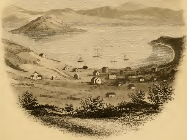
San Francisco in November 1846